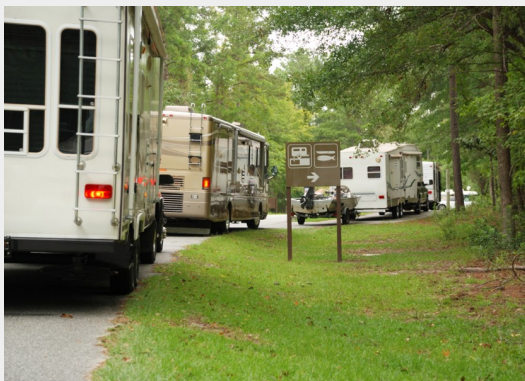
RV's in lineup at campground sewer dump station