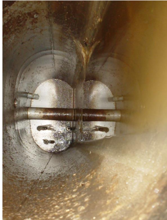
Pictures taken after tanks are emptied, both before (left Photos) and after treatment with BioTherm Eliminator (right photos). (90 gal. Tank) Note the elimination of sewage sludge and struvite in the top 2 photos, and the removal of sewage and struvite sludge in the bottom 2 photos.