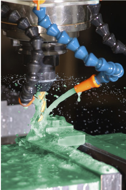
Use GreenCut at 20 : 1 mix ratio

GreenCut Cutting Fluid is SAFE and has superior performance: