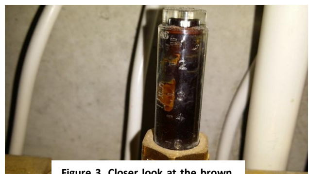
Figure 3. Closer look at the brown, slimy deposits caused by bacteria resulting in corrosion and fouling

There are products on the market to treat the water, but many use harsh, toxic chemicals and are quite ineffective in treating the stubborn bacteria found in the volcanic regions. Moreover, the toxicity of the chemicals is problematic in spills, leaks and water disposal.