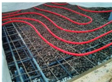
Figure 5. Residential In-floor Heating