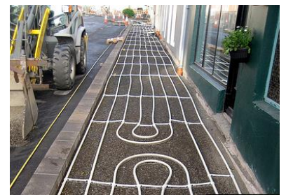
Figure 1. Heated Sidewalk

Iceland is a pioneer in the use of geothermal energy for heating purposes. Due to its location in a volcanic region, geothermal waters are used for heating everything from pavements, parking lots, shopping malls, houses, apartments to commercial buildings. In fact, geothermal heating in Iceland is mandated and 87% of all buildings are heated with geothermal water.