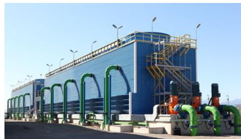
Figure 6. Cooling Tower Battery