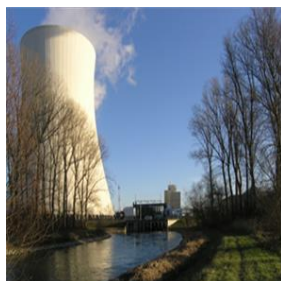
Figure 4. Commercial Cooling Tower

With a 2-year test completed, LubeCorp’s distributor in Iceland, Hrein Orka, continues with larger scale trials in Icelandic apartment buildings.